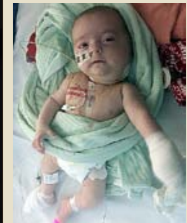
BATTLER Valentino after tumour op

Low-risk disease in babies typically has a good outcome with surgery or simply observation.